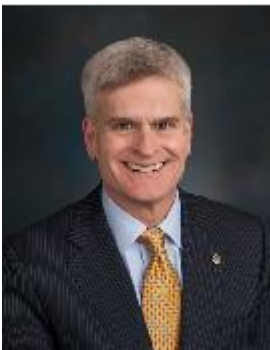
Senator Bill Cassidy (R-LA)