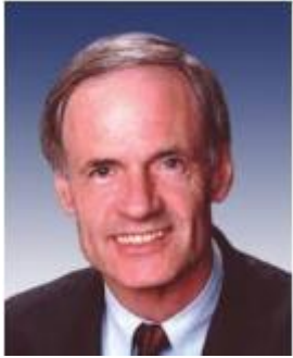
Senator Tom Carper (D-DE)