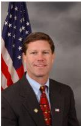
Representative Ron Kind (D-WI)