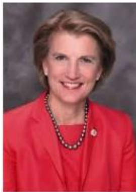
Senator Shelley Moore Capito (R-WV)