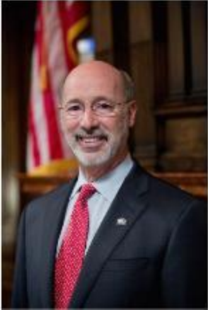
Governor Tom Wolf (D-PA)