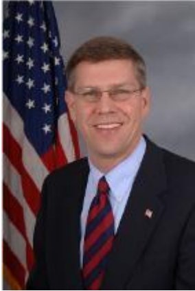
Representative Erik Paulsen (R-MN)